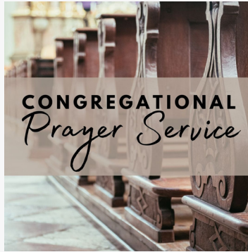
CONGREGATIONAL Prayer Service