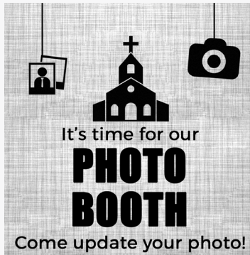
Photo Booth for the Directory Sept 17 & 24 // Student Alcove Come smile for our camera! This is a great time to update your individual CCB photo for our directory, especially if you don't have one. Whether you're a first-time visitor or a long-time member, we encourage you to stop by!